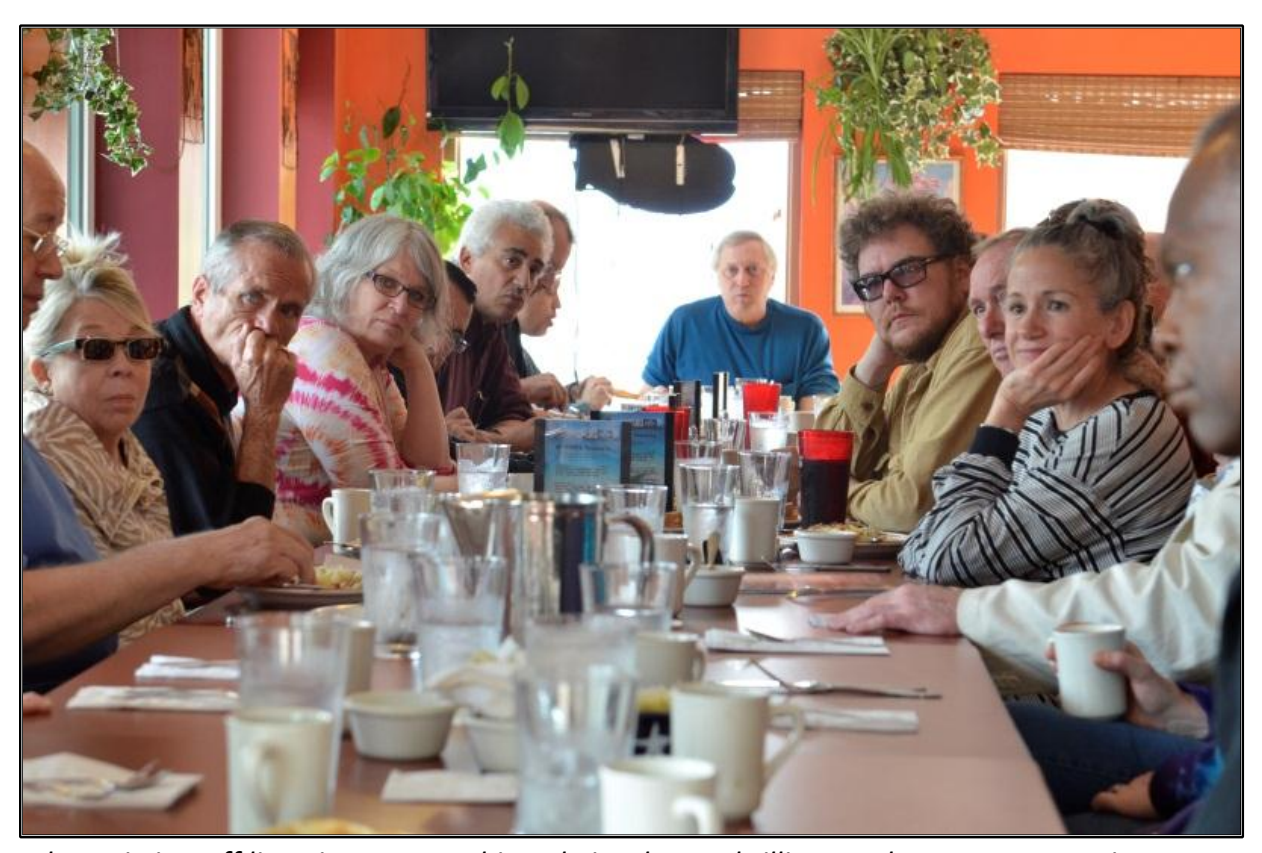
The artistic staff listening to something obviously very brilliant at the wrap-up meeting.

To summarize the results, artists who ran a program with lots of specific one-on-one interaction with participants (Ten-Minute Play Slam, Monologue Workshop, Acting for Singers) were among the highest vote-getters. Their positions involve intimate one-on-one work, and it is not surprising that they had multiple citations. All three of these programs are well run and in keeping with the spirit of the event.