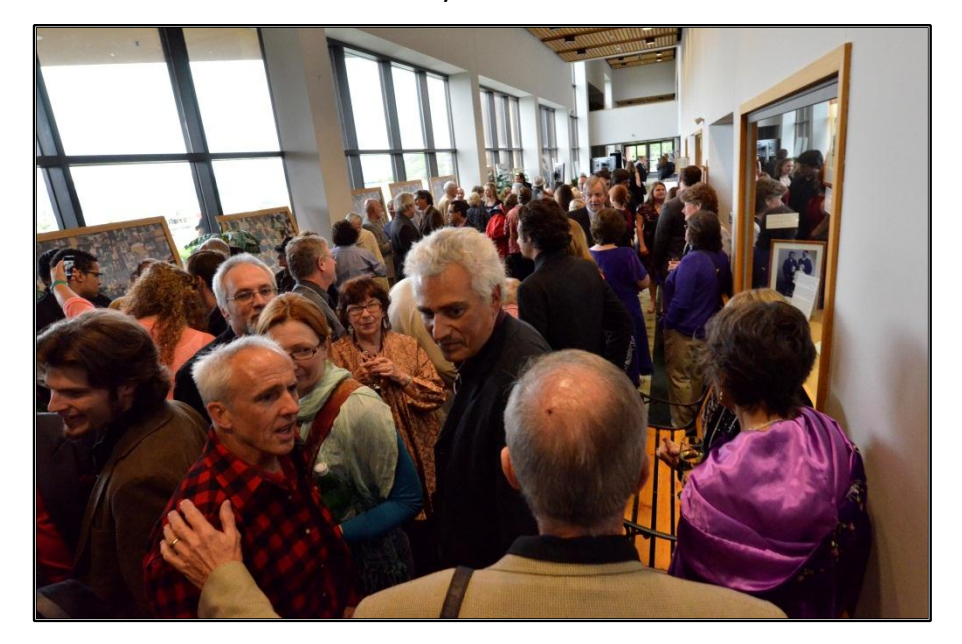
Artists waiting to be let into the closing evening gala.

We tried out a new methodology of scheduling this year, having only two play readings at a given time, sometimes competing with classes. It wasn't a disaster, but possibly this accounts for the reduced rankings in this section. It's also subjective: one year's group of participants may experience the time crunch differently than another one.