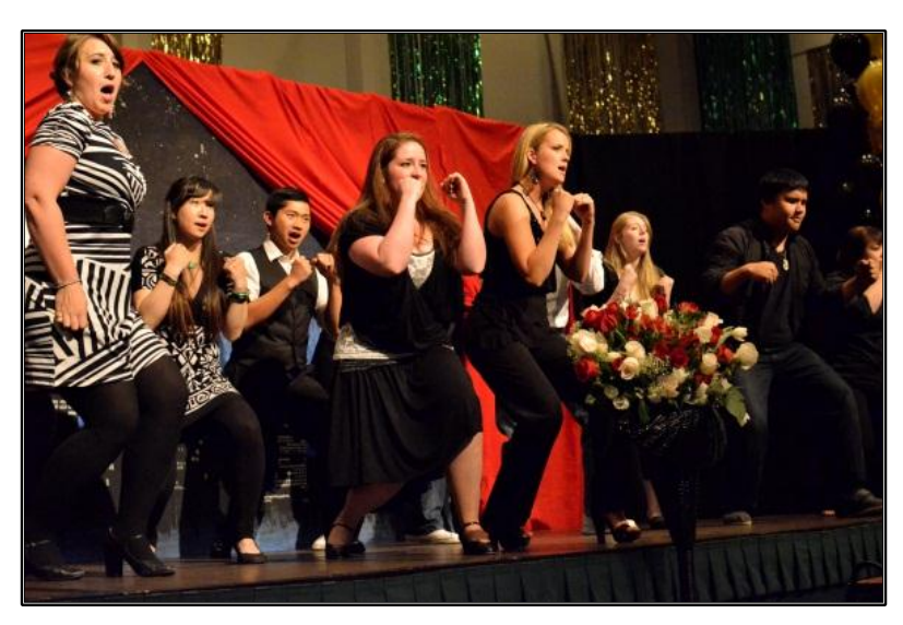
UAA Glee Club performance at the closing night gala.